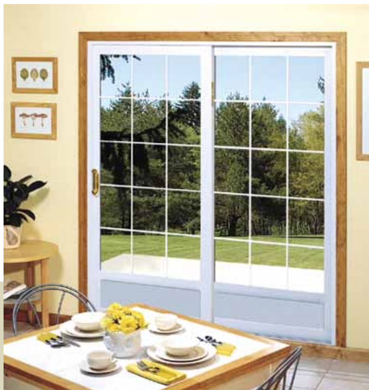
The French-Style Legance™ Patio Door features color-coordinated, reinforced kick panels for added insulation and an elegant French Door appearance.