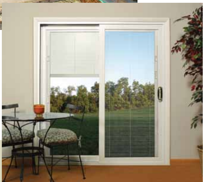
The Legance Patio Door's optional Inside-the-Glass, Vari-Tilt™ Mini-Blinds* raise, lower and tilt to enjoy the view or privacy.